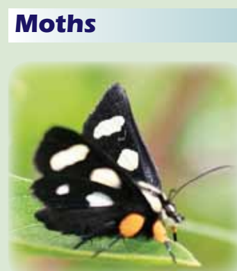
Eight-spotted Forester Moth