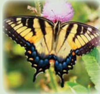
Eastern Tiger Swallowtail