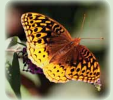
Great Spangled Fritillary