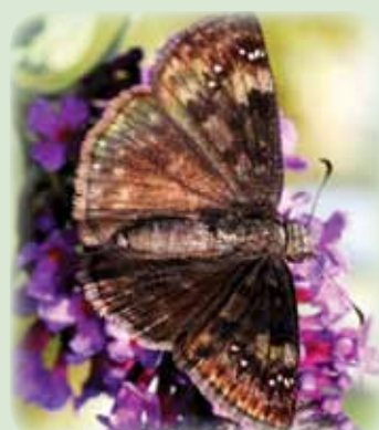
Wild Indigo Duskywing