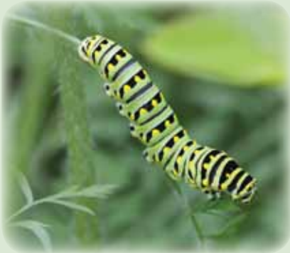
Black Swallowtail Caterpillar

People associate these captivating insects with a beautiful summer's day, and for good reason: Butterflies, flowers and sunshine just seem to go together. If you see a butterfly, chances are you're in a pretty good place – a spot that is sunny and warm, with blossoming flowers nearby. Small wonder that butterflies might just be the world's most popular bugs.